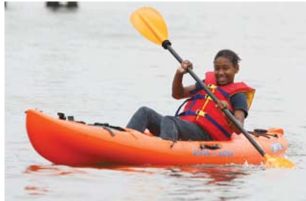
Red Hook Boaters offered a free, public kayaking program at Valentino Pier Park.