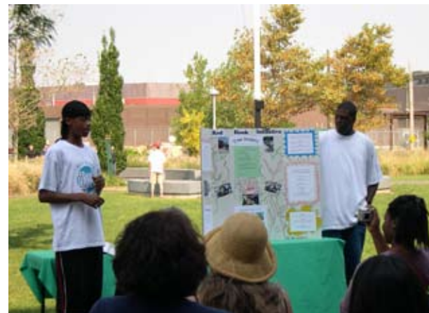
Red Hook Initiative created an internship program and selected two teenagers to educate the community about the importance of street trees and how to care for young trees.