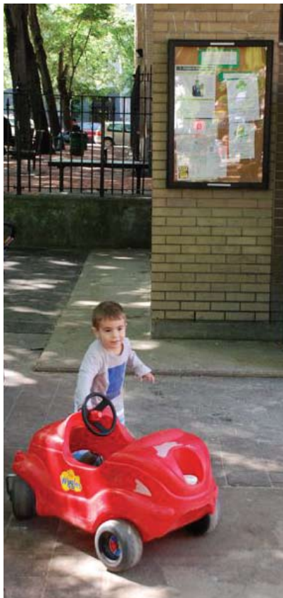
Friends of Blecker Playground installed a bulletin board to inform playground users about events and how to get involved.